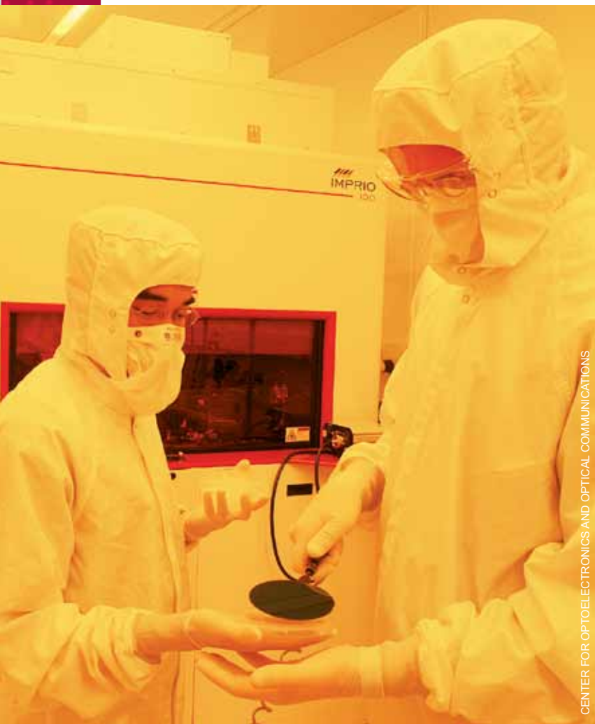
CENTER FOR OPTOELECTRONICS AND OPTICAL COMMUNICATIONS

Why is Charlotte in the limelight for photonics-based and optics-related industries? Just as the city is a hub for other sectors such as finance, information technology and defense, Charlotte offers new technology companies an environment in which they