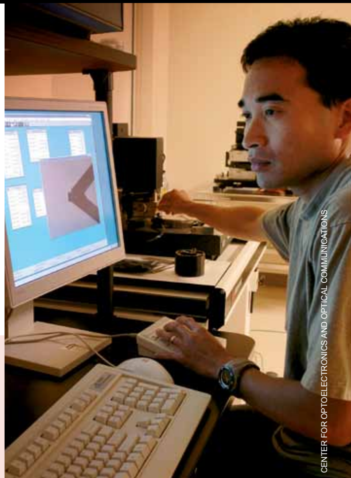
CENTER FOR OPTOELECTRONICS AND OPTICAL COMMUNICATIONS

Already home to over 130 photonics facilities, North Carolina long ago recognized the potential of optical technologies. At the center of the region's optics belt (along the I-85/I-40 corridor stretching from Spartanburg, SC in the southwest to the Research Triangle Park in the northeast), Charlotte is home to one of the nation's major optical technology clusters.